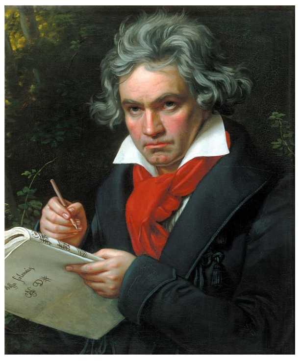
Ludwing Van Beethoven