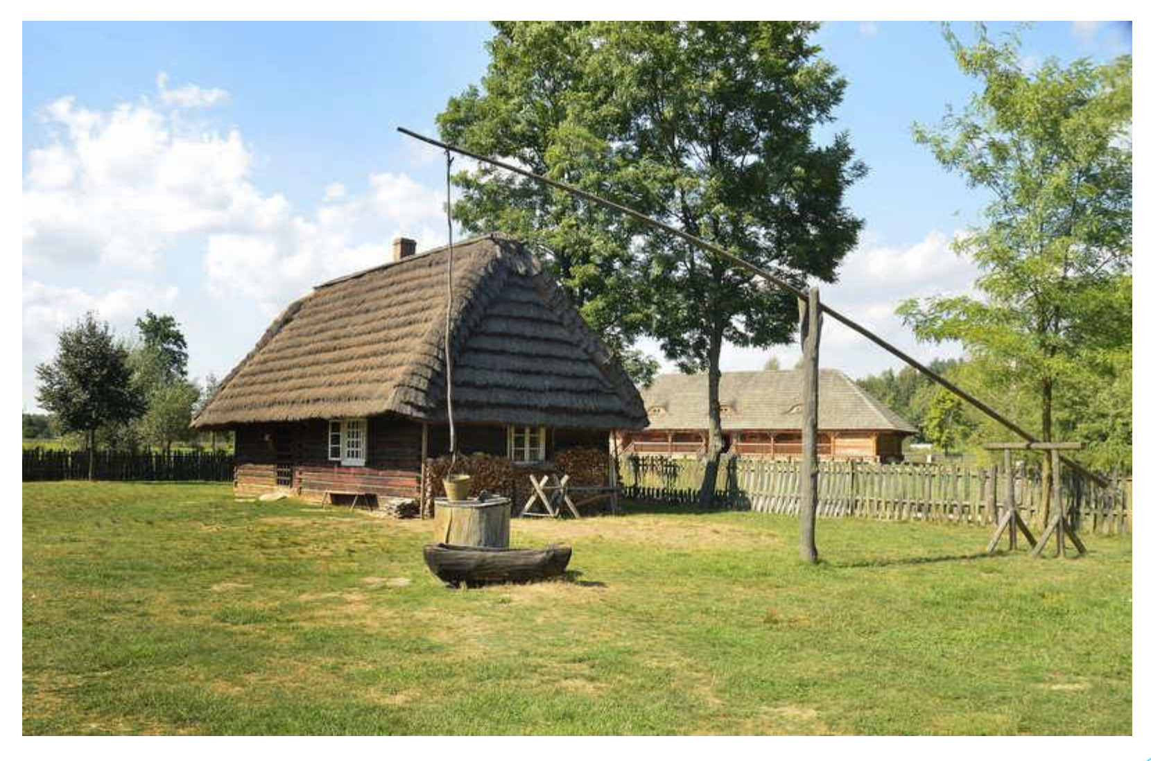
This place reminds us how Lasowiacy and Rzeszowiacy (people of our region) lived formerly.