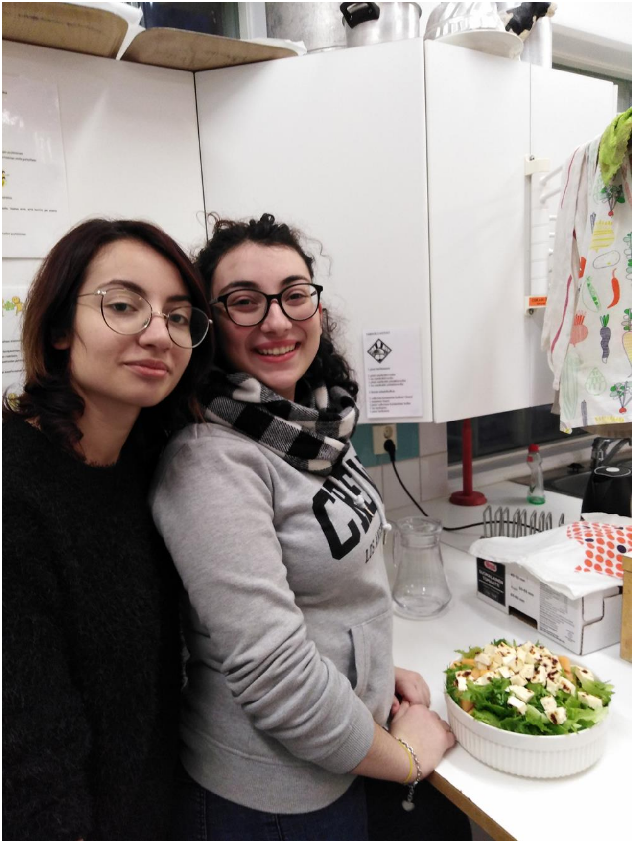
We prepared and set the table as we were a big family!